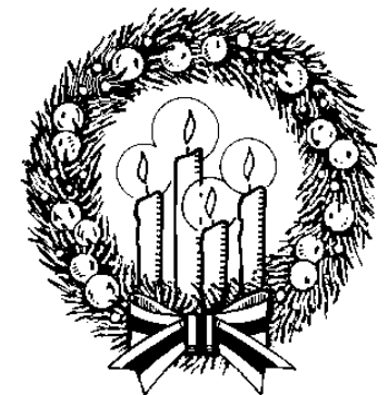
The Fourth Sunday of Advent

Monday Luke 1:26-33 Tuesday Luke 1:34-35,38 Wednesday Luke 1:39-45 Thursday Luke 1:46-56 Friday Luke 1:57-66 Saturday Luke 1:67-80