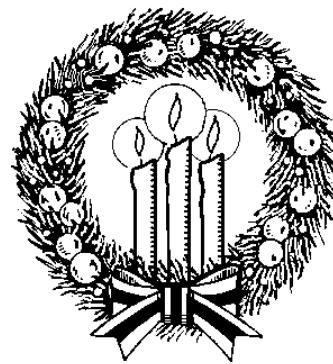
The Third Sunday of Advent

Monday Isaiah 7:10-14 Tuesday Isaiah 11: 1-6 Wednesday Isaiah 40:10-11 Thursday Isaiah 52:7 Friday Jeremiah 33:14-16 Saturday Malachi 3:1-2